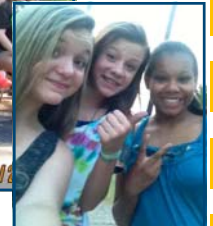
All pictures in this brochure were taken with permission at Camp Endres 2013