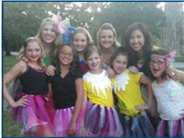
Camp Endres is a great place to be... ME!

Diabetes Solutions-OK, Inc. 3333 NW 63rd, Suite 100 Oklahoma City, OK 73116 (405) 843-4386 www.dsok.net